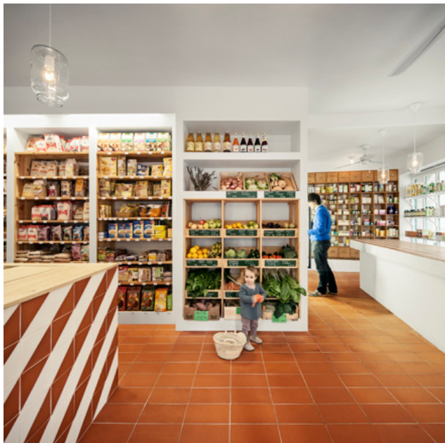
Bodebo Store by CAVAA.