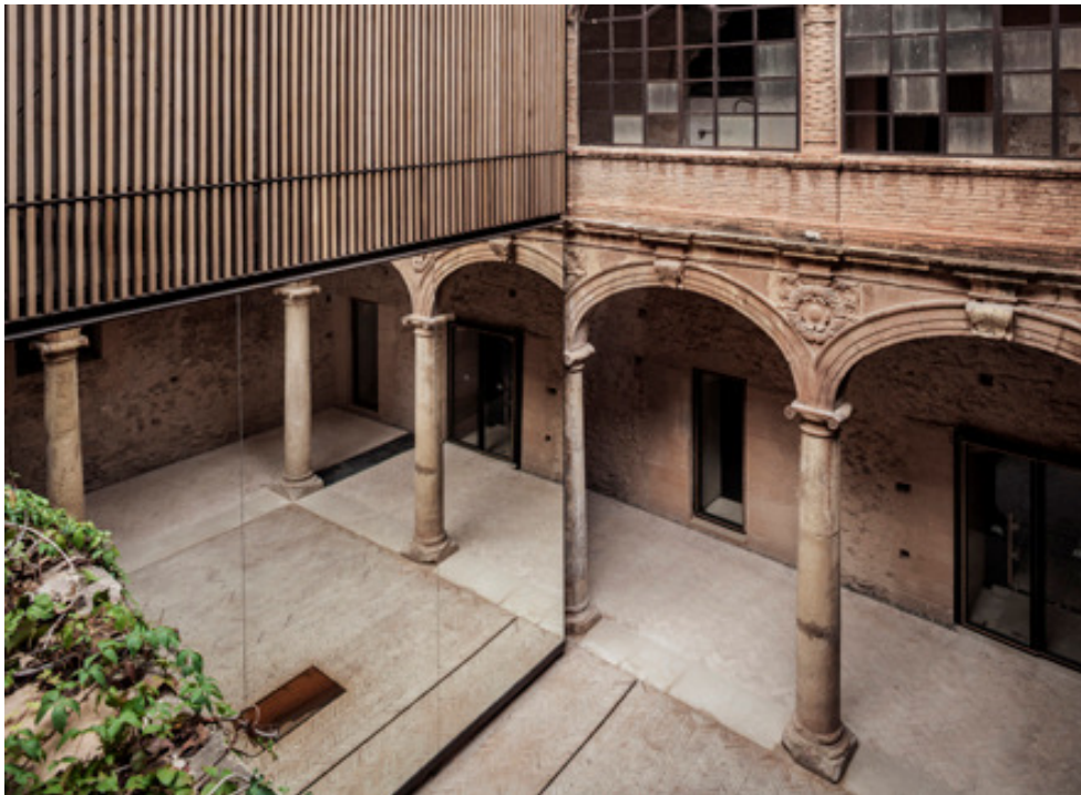
Restoration of the cloister at Betxí Castle, by El Fabricante de Esferas.

First prize in the Interior Design category was awarded to the project entitled “ Restoration of the Cloister at Betxí Castle ” by El Fabricante de Esferas studio. The judges remarked on the conceptual transformation of the interior space of the cloister through the inclusion of a large mirrored surface that forms a “virtual construction” of half of the lost Renaissance cloister. The work focuses on recovering the cloister space by including a traditional terracotta wall.