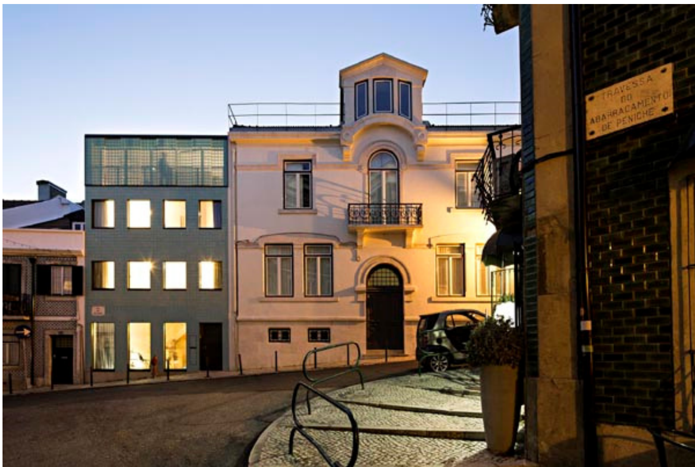
House in Príncipe Real by CAMARIM Arquitectos.