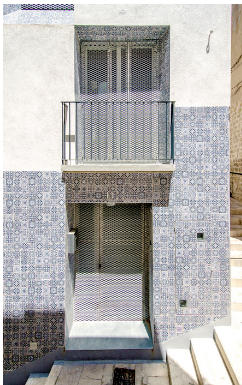
El Enroque House, by Ángel Luis Rocamora.

— “Casa Andamio” by bosch.capdeferro architectures . One of the features that the judges particularly appreciated was the highly intelligent approach to an intervention on an existing building, as well as the use of glazed ceramic tiles in various construction elements as a means of catalysing specific plays of light within the transition spaces between the interiors and exteriors.